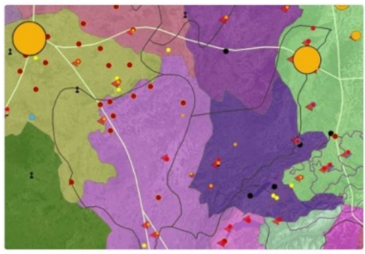
17:46 - 26 iun. 2018

ERC (Social Sciences and Humanities), and by On. Dario Franceschini, Italian Minister for Culture (2014-18). There will be simultaneous translation Italian / English.