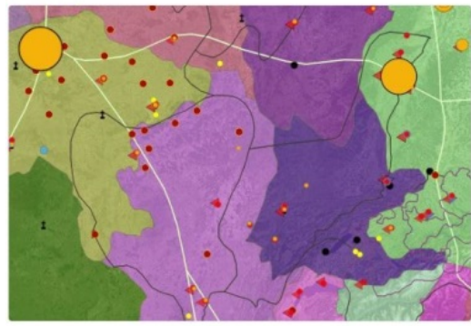
17:46 - 26 iun. 2018

ERC (Social Sciences and Humanities), and by On. Dario Franceschini, Italian Minister for Culture (2014-18). There will be simultaneous translation Italian / English.