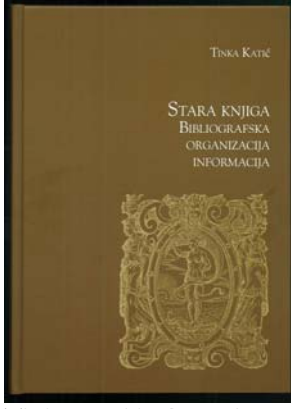
Tinka Katić, Stara knjiga: bibliografska organizacija informacija (Zagreb: Hrvatsko knjižničarsko društvo, 2007). XII, 202 str. (Posebna izdanja Hrvatskoga knjižničarskog društva; knj. 12). ISBN 978-953-