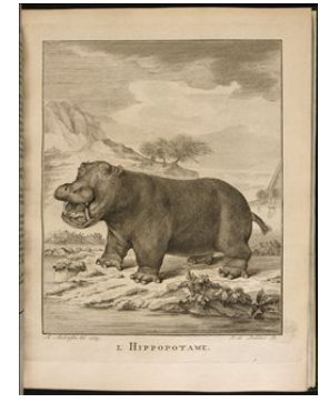
Buffon, Georges Louis Leclerc, The Natural History of the Hippopotamusor River horse. 1775, British Library Board

The British Library has become the latest library to enter into a partnership with Google to digitise its collections. Plans were announced on 20 June 2011 to digitise around a quarter of a million out-of-