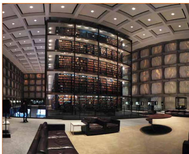
Yale University Libraries

HPB is made available free of charge to readers at CERL member libraries and subscribing institutions.