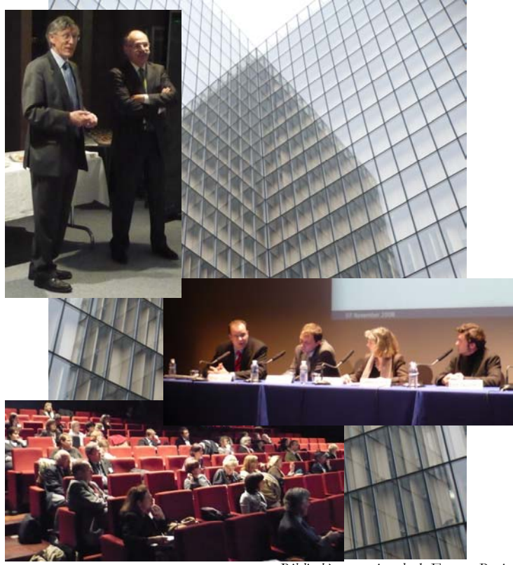
Bibliothèque nationale de France, Paris

Members also discussed progress with the Consortium's services (HPB, CERL Thesaurus, and CERL Portal) and heard reports from OCLC, the Advisory Task Group, and the Working Group on the Future Development of CERL.